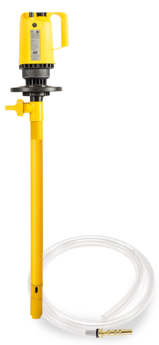
Industrial Descaling System 75LDP